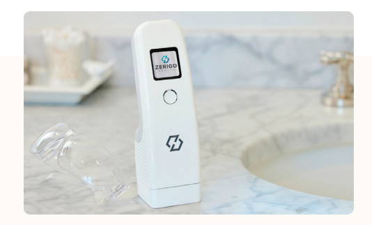
FDA-Cleared¹ Smart Light Therapy Device:

With the Zerigo Health Solution, you can treat your eczema or psoriasis with smart light therapy in the comfort of your own home.