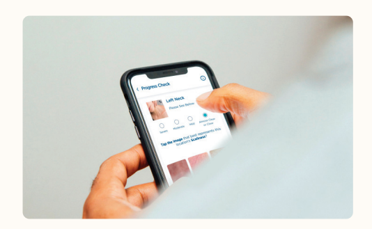
Zerigo Smart App:

One-on-one live expert coaching for every step of your healthy skin journey—as much or as little as you need. Real support from real people (bots not allowed).