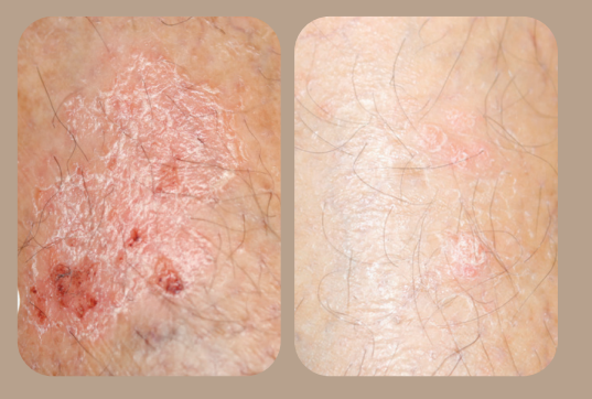
Before | at 0 weeks.